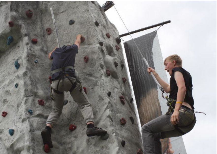
Adventure at Party-in-the-Park